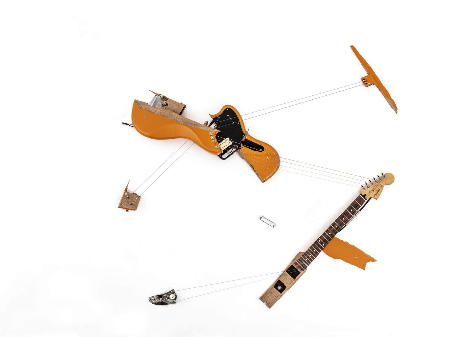
Naama Tsabar, Melody of Certain Damage #14 , 2021, broken electric guitar, strings, microphone, screws, dimensions variable.

Cassie Packard Features 08 April 2024 ArtReview