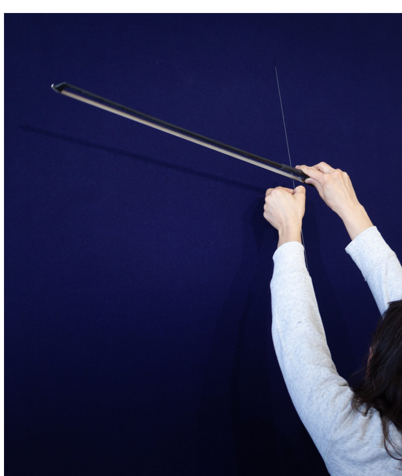
Inversions, 2020 (performance view, Inversions, 2020, Shulamit Nazarian, Los Angeles).

When gallerygoers encounter the Melodies , the destructive act has already occurred. Instead of witnessing the break, we inhabit the brokenness, striving to make new sounds, languages and systems out of what arrived in pieces. To play these erstwhile guitars, viewer-participants assume intimate and vulnerable postures, kneeling, squatting or even lying down as they meet the constellated constructions with their bodies; most pluck the strings with their fingers, though some performers have also used guitar picks, percussion mallets and bottles. Like Tsabar's other deviant instruments, the Melodies invite necessarily amateur, intuitive and 'failed' modes of music-making (and, for that matter, exhibition-going). The intrinsic value ascribed to such experiences by her practice chimes with Jack Halberstam's assertion, in The Queer Art of Failure (2011), that 'under certain circumstances failing, losing, forgetting, unmaking, undoing, unbecoming, not knowing may in fact offer more creative, more cooperative, more surprising ways of being in